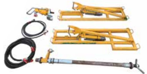
Drum Elevator (CVI609) shown with axle for steel drum (CDT063)